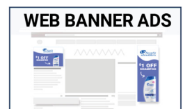
WEB BANNER ADS

nData Services will help you every step of the way!